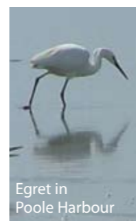
Egret in Poole Harbour

This turns right at the end of the boatyard buildings and leads on to open ground.